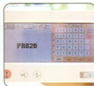
Built-in Keyboard Lettering