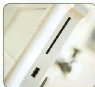
USB port and memory Card