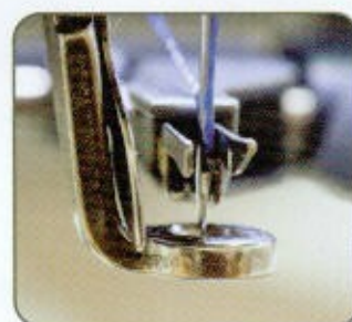
Automatic needle threader