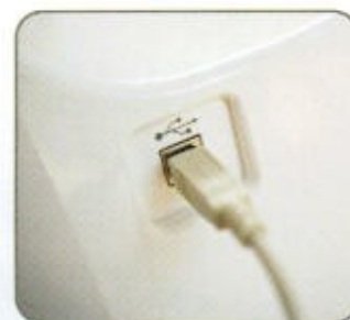
2nd USB port