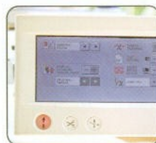
Colour thread information